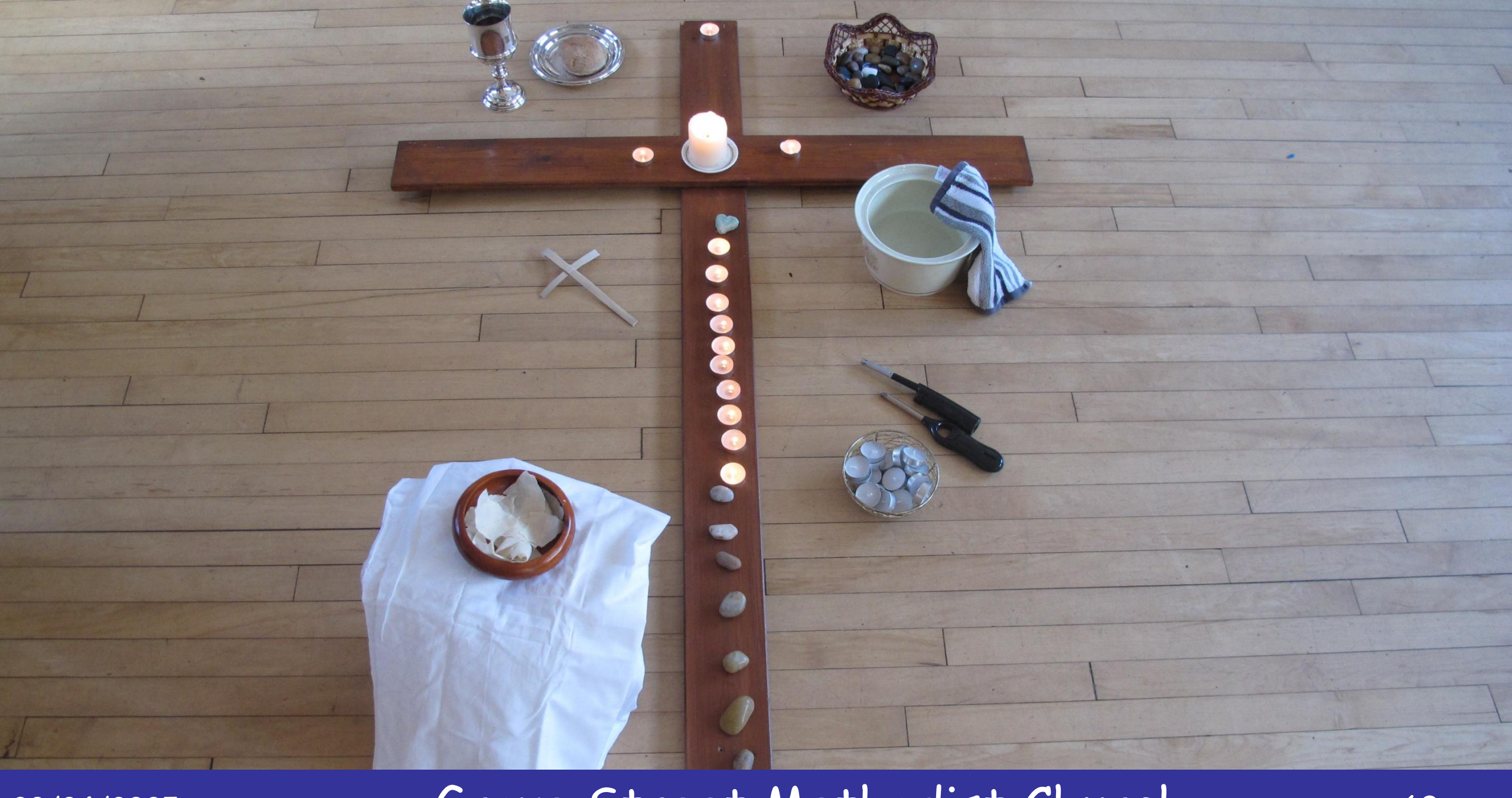
Grove Street Methodist Church